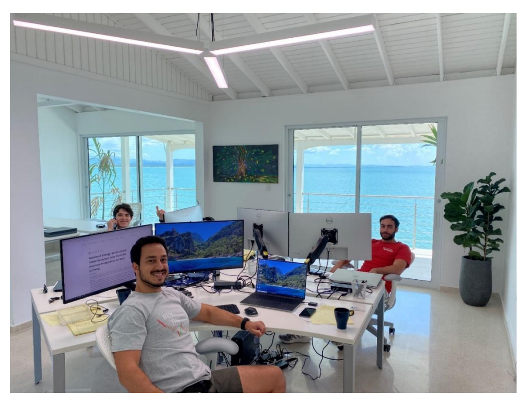
Our analyst team...