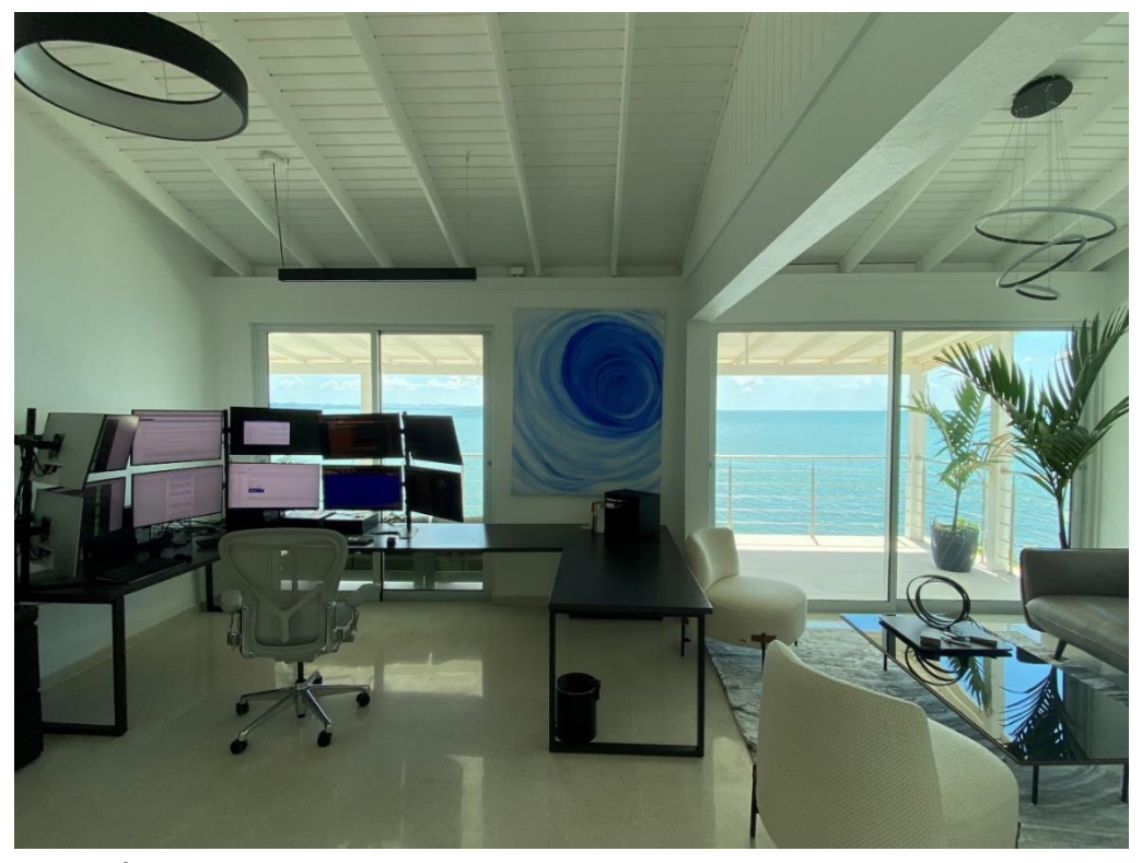
My trading setup...